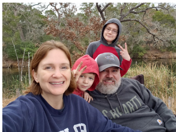
Lake Bastrop (Jan)