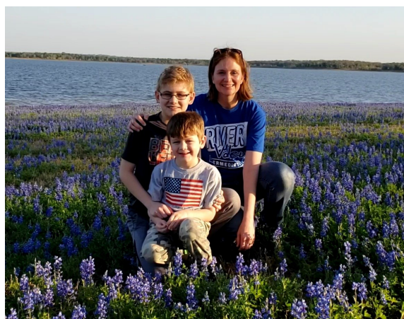
Lake Somerville (March)